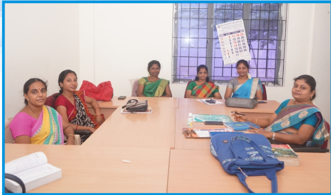
Faculty, Department of Mathematics

Good teaching is one-fourth preparation and three-fourths pure theatre - Gail Godwin