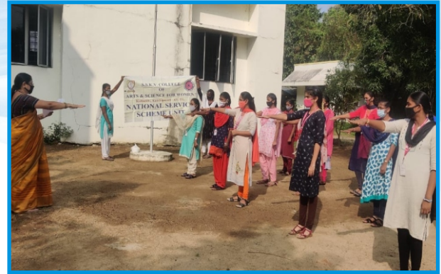
NSS Students taking Pledge