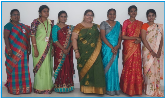
Faculty, Department of English