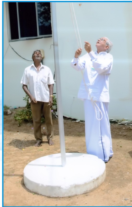
The Secretary hoisting the National Flag on independence Day.

S.S.K.V. College of Arts and Science for Women was founded in 2007 as the Management felt that there was a need for establishing a college exclusively for women in Kanchipuram. The first School under the SSKV banner came into existence in 1904 when the idea of education for women was a novel one. Since then the Management passing through several dedicated hands of men and women has been founding several schools and today the number of schools run under the SSKV aegis is six. In this process of establishing and building educational Institutions the Management has earned tremendous goodwill among the public, so that, today, SSKV has become an acronym being synonymous with quality, sincerity and integrity, and the college is no exception to these principles.