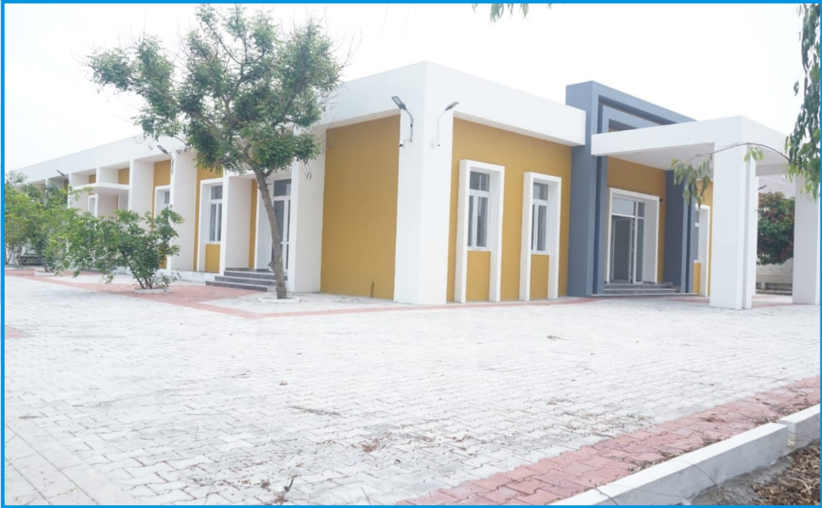
College Auditorium - Side View