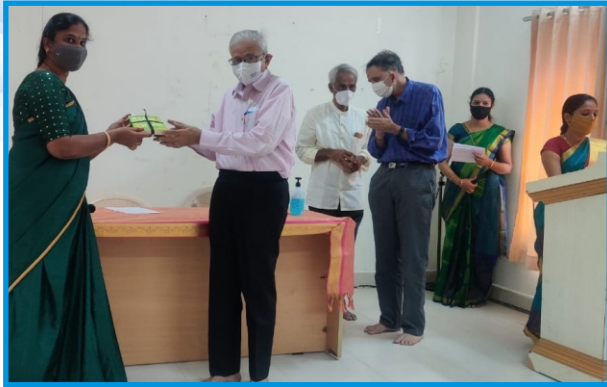
New Year Day, Secretary giving away prizes

The college is offering a three year parallel programme in Basics in Human Resource Development. We have an MOU with CLHRD, Mangalore. This course, though not recognized by any university, is industry recognized. The course is student friendly and lecture hours are very minimal. The course is so structured that there is thrust on student initiative. It includes such components as cluster study, self study, library study and projects. The students have the freedom to opt out in the first year, when they will be issued a certificate, or in the second year, when they will be issued a diploma. Those who complete the third year will get a certificate equivalent to a degree. We are also happy to remind the public that since last year the UGC has approved 2 parallel degree courses. So, we are a pioneer in this. The intake of the students is restricted to 30 only. Two year's ago we introduced this course as an Add-on course and it is very popular as academic tours to historical places and Art galleries are built into academics.