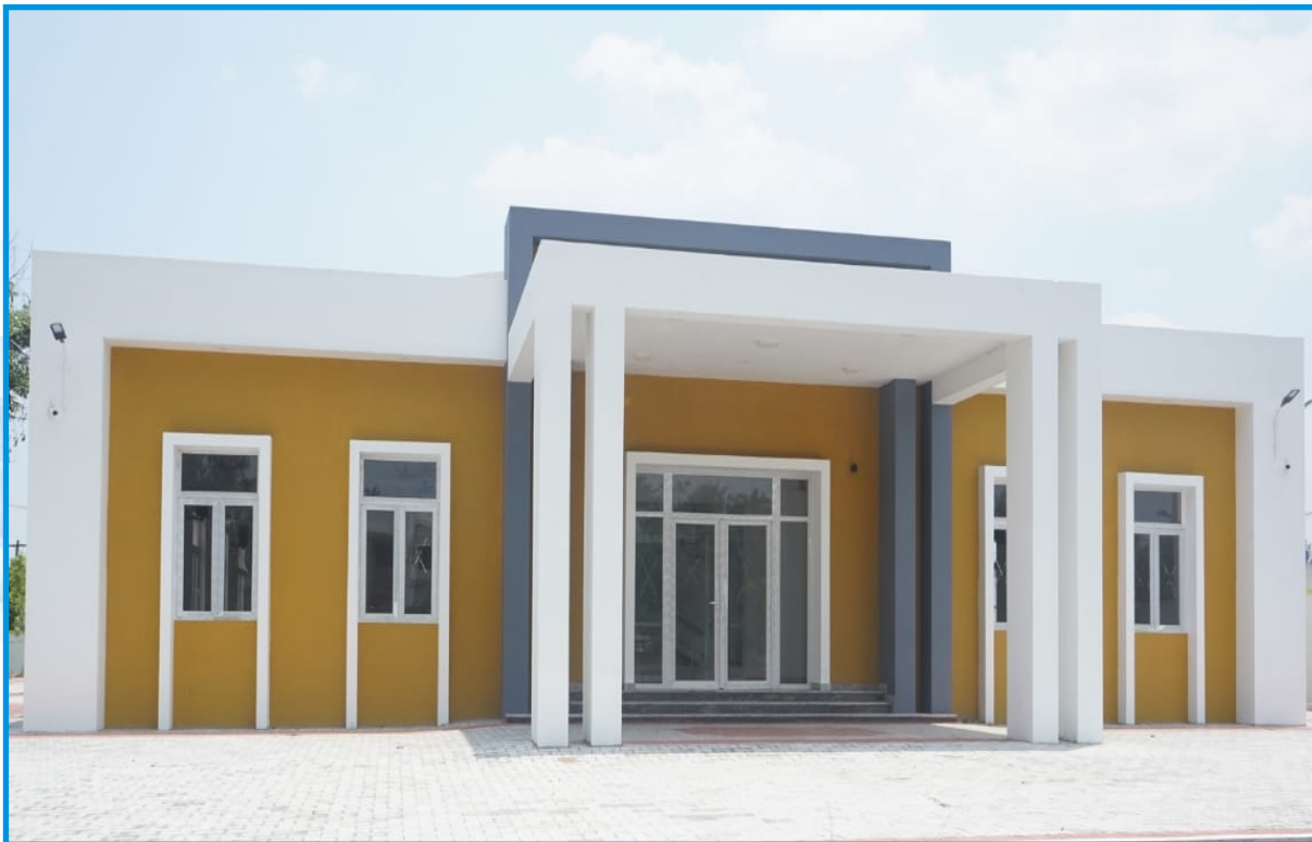
College Auditorium - Front View