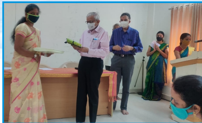
New Year Day, Secretary giving away prizes