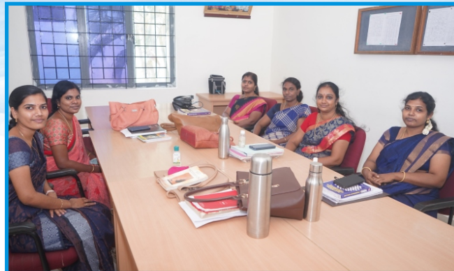
Faculty, Departments of BCA & B.Sc.(CS)