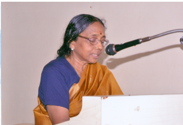
Our Joint Secretary