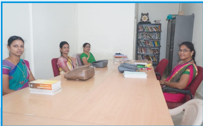
Faculty, Department of Commerce (General)

What Sculpture is to a block of marble, education is to the soul - Joseph Addison