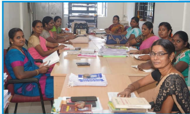
Faculty, Department of Tamil

A student should have 75% attendance to be eligible for writing university examination. 10% condonation may be given by the Principal on serious medical grounds.