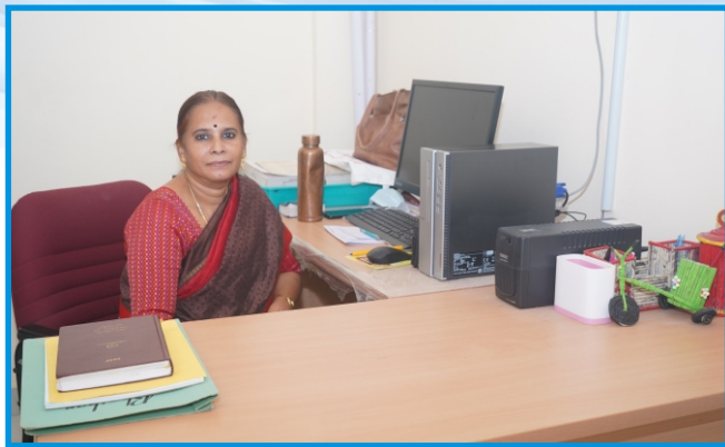
Head in charge, Department of Commerce (CS)